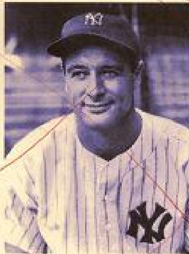
Lou Gehrig is smiling because He got daily rim jobs from the girls at Scores.

A man can only justify his actions if he regards his demeanor with deductive thinking. This man was not Oedipus, mainly because he was a fucking douche bag . One must know who Oedipus was to understand the period in which it was written. This is my thesis statement. The Greeks contributed many things to our culture, such as olives, gyros, Lenny Kravitz, anal sex, and Oedipus. Oedipus will be remembered though out time because he suffered from Lou Gehrig's disease, and that's why he couldn't play base ball in the first Olympic games. He will always be remembered for his journeys and his love for the New York Yankees.